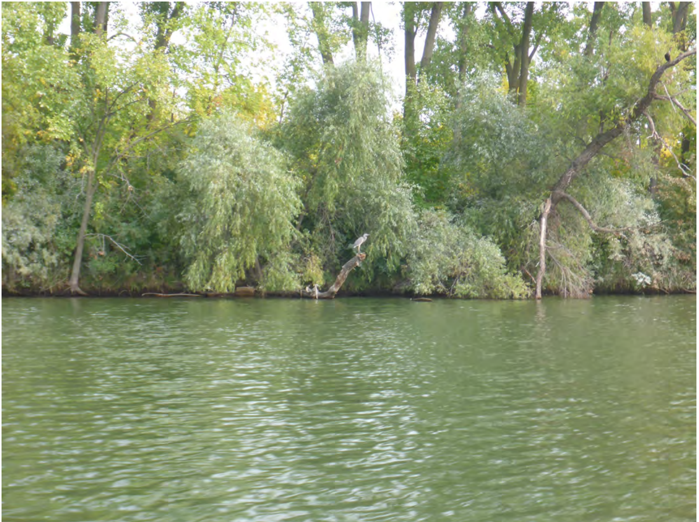
Rice Lake, September, 2023