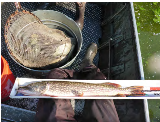
Figure 3. [top] A trapnet is a live fish trap. Fish run into the 50-foot lead net and follow it back through a series of hoops with funnel mouths. Fish end up in the back hoop. [middle] A handheld net is used to remove the fish from the back of the trapnet. [bottom] Fish are transferred to tubs, then they are counted, measured, and released.