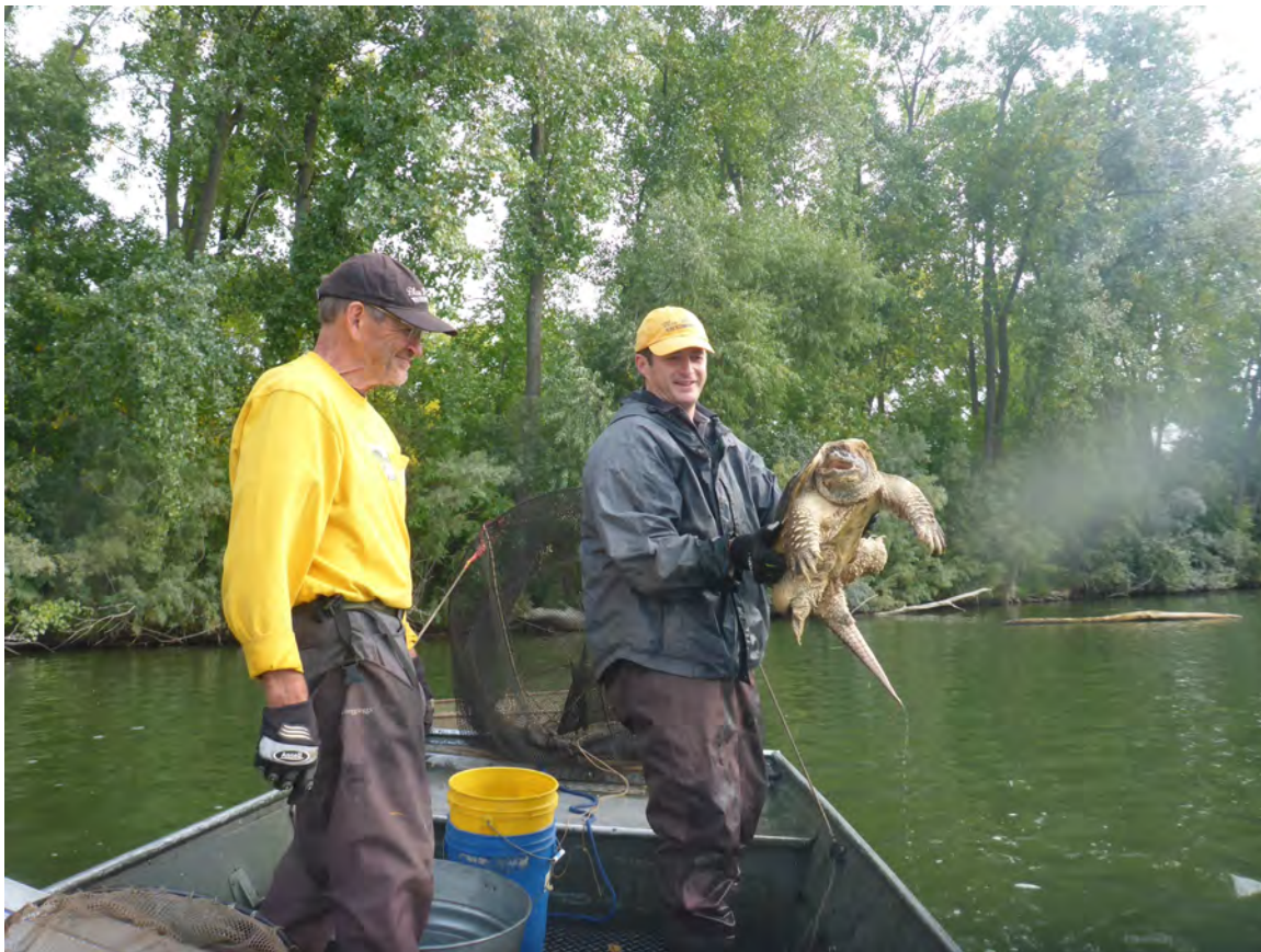
Figure 4. Snapping turtle collected in September 2023.