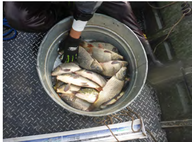
The dominant fish in the Rice Lake 2023 fish survey were black crappies at 522 fish/net (left). Carp were common at 12 fish/net (right).