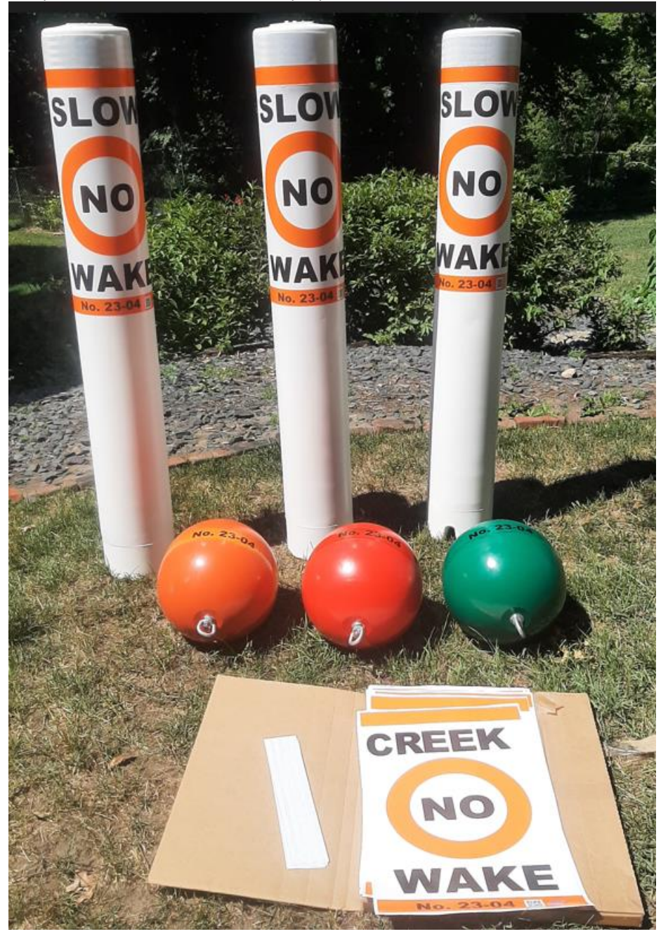
Buoys received 7/25/2023 and deployed on 7/29/2023.