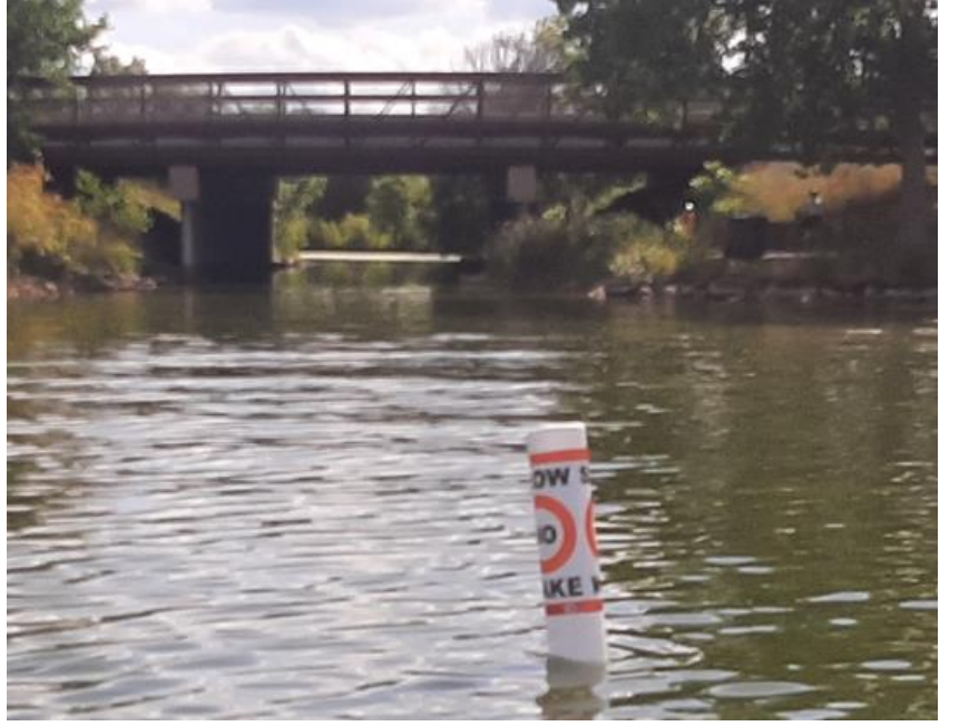
Creek entrance to lake under I-94 bridge (north)