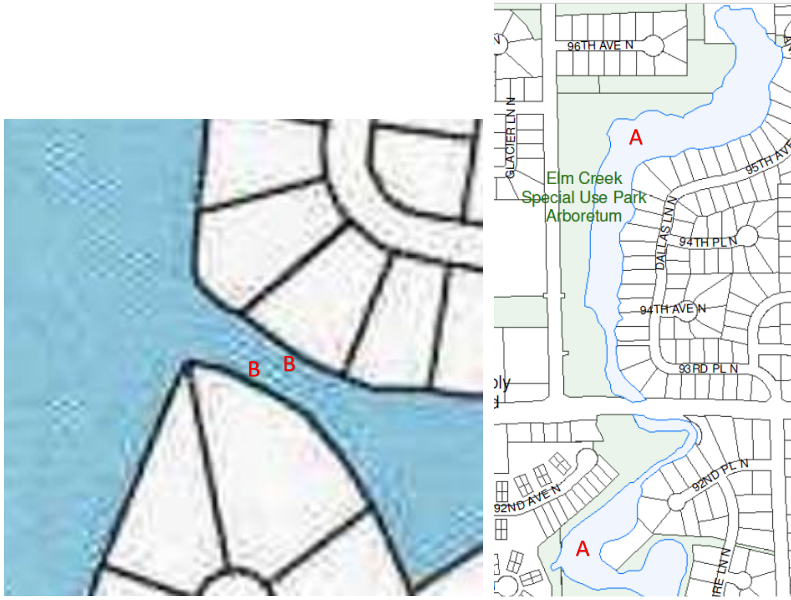
Elm Creek (north of County Road 30)